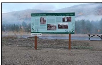
New signage installed along Highway 22A, just north of the border crossing.