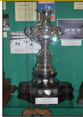
Daily News Cup back in place in the SHM.

In addition, the Daily News Cup is finally