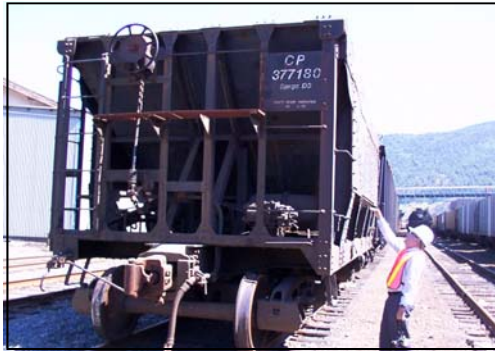
Society President Jamie Forbes with the ore car at Teck in 2002. The ore car will be completely refurbished to resemble the ore cars of the 1950s and 1960s.

Our plan was to refurbish the car and display it in Jubilee Park as a lasting symbol of what the mining and smelting industry means to our community. In 2005, Council approved the placement of the car in the Park.