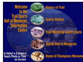
Home page of the Interpretive kiosk in the Sports Hall of Memories

Issues include upgrading the kiosk software from its original version nearly ten years old and how the software will work with the proposed new operating system. Additional problems may include the current