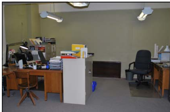
The newly-renovated main office of the Trail Historical Society.

hide the exposed brick of the original building. The City's engineering files were moved into the middle room between the archives and the office, to give the engineers a space of their own for